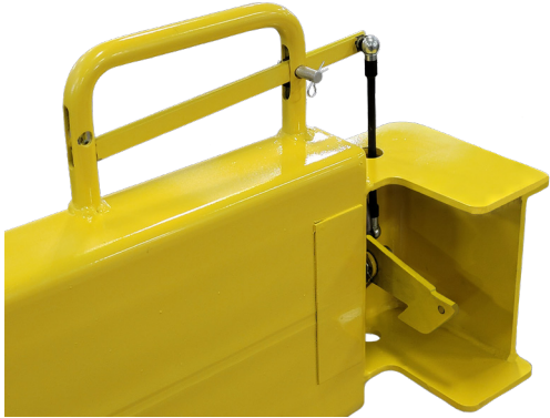
Latched grab handle allows for faster, easier opening and closing

The Dock GUARD helps prevent falls from an open loading dock, as well as protects overhead doors or other equipment from damage caused by forklifts. The barrier is designed with a single safety rail that stands 42" tall, heavy-duty bollards, and easy-glide hinges for effortless opening/closing.