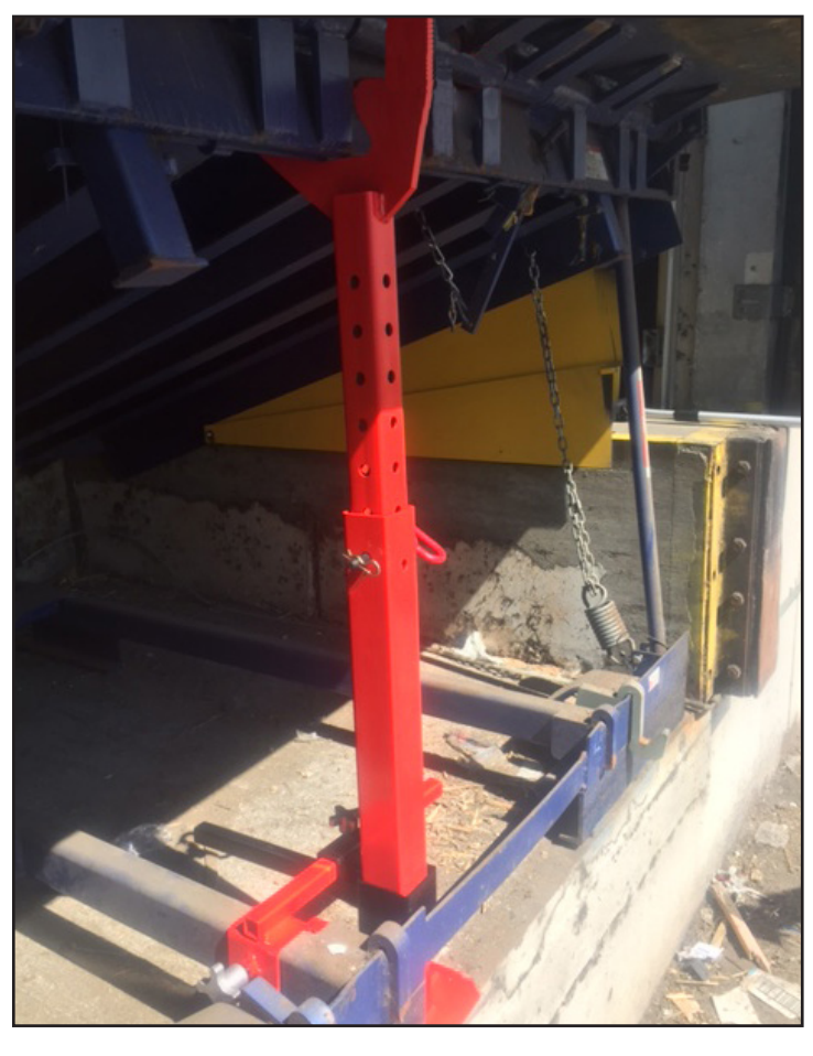
Shown on a CentraAir Series dock leveler, the Tough Strut will help provide safety at the loading dock by adding another means for additional support to air or mechanical levelers during maintenance.