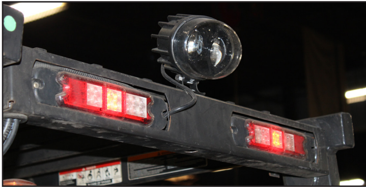
TRUCK-E light shown wired into the lights and mounted on rear portion of the forklift's overhead guard.

The TRUCK-E light is an innovative blue forklift light that helps avoid forklift and pedestrian collisions by shining a bright blue warning beam on the ground behind the forklift. In the USA alone, there are thousands of forklift/pedestrian accidents each year, many of which can be avoided by the addition of a visual warning to the pedestrian that a forklift is backing in their direction.