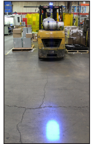
The bright focused beam provides ample warning to pedestrians and other forklifts in the area.