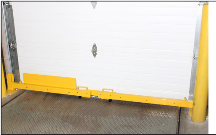
The left gate is shown with optional extended cart shield. The right gate is shown as standard.

The Door SHIELD™ is designed to protect the bottom panel of the overhead door from the daily dings and collisions caused by pallets and rolling carts. The Door SHIELD lowers in front of the door protecting the bottom panel by engaging with the floor or dock leveler preventing items from being pushed into the door.